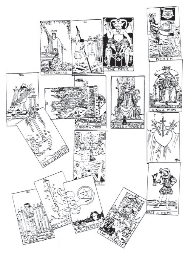
Figure 2. Sam's Tarot spread.

briefly address the whole layout representing the projection of Sam's unspoken concerns and then focus on the Devil card as the projected Shadow.<sup>3</sup>