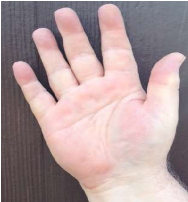
Figure 6 Dominant Hand of Reviewer

In using this book, I suggest that one take it in small doses. For instance, reading a full chapter about the mounts or the major lines, perhaps with a study partner, so that one can compare and contrast features in each other's palm. In this way one can enjoy the different perspectives of how we see the same features so differently, initially. It is definitely a playful way to learn how to observe in great detail, and then see if the observation matches the classic characterological traits. Hand reading is a cooperative art, Goldberg reminds us. Common features are discussed as our common variance. Next, discrete features are discussed in their alternative possible interpretations. Like in all sciences of correspondence, such as the astrology chart, or a random spread of tarot cards, one begins to see patterns of reiterated messages that to the practiced eye begin to repeat themselves. We become aware of the glaring features of suggested personality features quite quickly, but the unique feature of Goldberg's and Bergen's treatment is they discuss subtle details that are not otherwise treated in contemporary palmistry manuals.