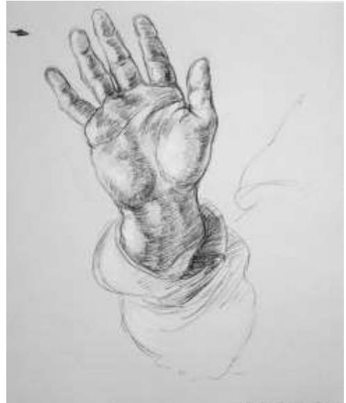
Figure 3 Hand Drawing by an Old Master