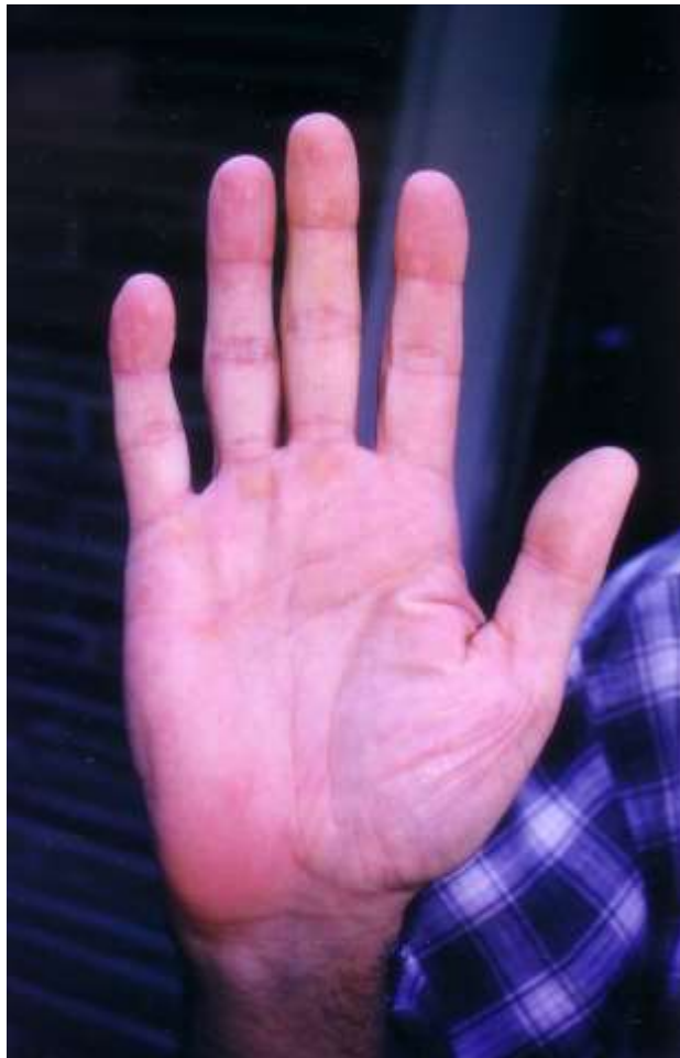
Figure 5 Tarot artist Robert Place's palm shows the prominent mystic blush of the artist and psychic.

The book is systematically arranged like an atlas to the main features of the hand. In the introduction we are given a general map of the principal regions of the hand in palm reading and the basic terminology. Afterwards, each chapter reveals greater detail of what the various features on the hand may mean in the region that they appear.