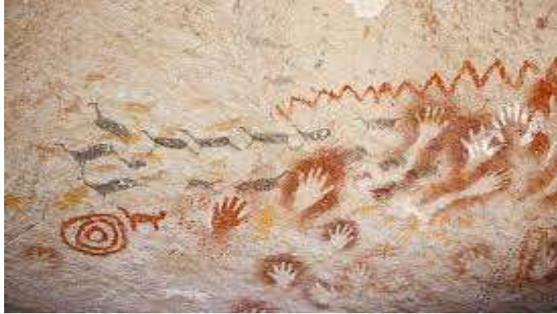
Figure 2 Paleolithic Cave Hands: Tracks in Pursuit of Game. Patagonia, Argentina, ca. 9000-8000 BCE

Palmistry, likewise, has many practitioners; and in many ways is the more physically intimate of contemporary arts of divination. The hand, being an extension of the body and a primary instrument of action, has been pondered and investigated as a crucial summary of a person's life. Its variant lines and mounts may well have been the first objects of contemplation during times of leisure in our Paleolithic past.